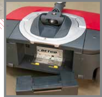
Lithium ion battery with 3 year full warranty