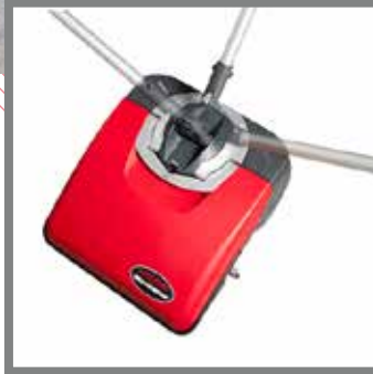
360° motion to clean in all directions