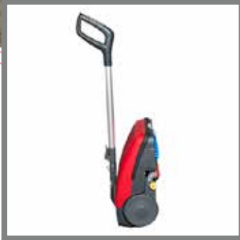
Easy Storage - takes less space than a mop & bucket